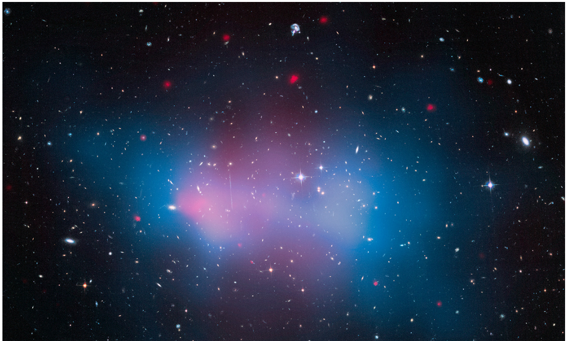
X-rays are shown in pink.

Take the "El Gordo" galaxy cluster, catalogued as ACT-CL J0102-4915. It's the largest known galaxy cluster in the distant universe. A galaxy like the Milky Way might contain a few hundred billion stars and up to just over a trillion ( 10^{12} ) solar masses worth of matter, the El Gordo cluster has an estimated mass of 3 \times 10^{15} solar masses, or 3,000 times as much as our own galaxy! The way we've figured this out is fascinating. By seeing how the shapes of background galaxies are distorted into